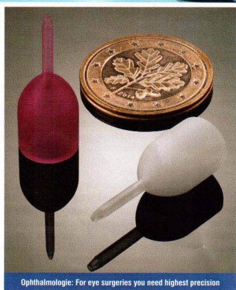
Ophthalmologie: For eye surgeries you need highest precision

M iniaturization is one of the major trends in medical technology. In modern medical devices, very little space is available for precision silicone components. Frequently, individual components only have a size of a few millimeters. Nevertheless, they must reliably perform their increasingly complex functions. As a result, the shapes of the components are also becoming more complex and are subject to tighter and tighter tolerance limits.