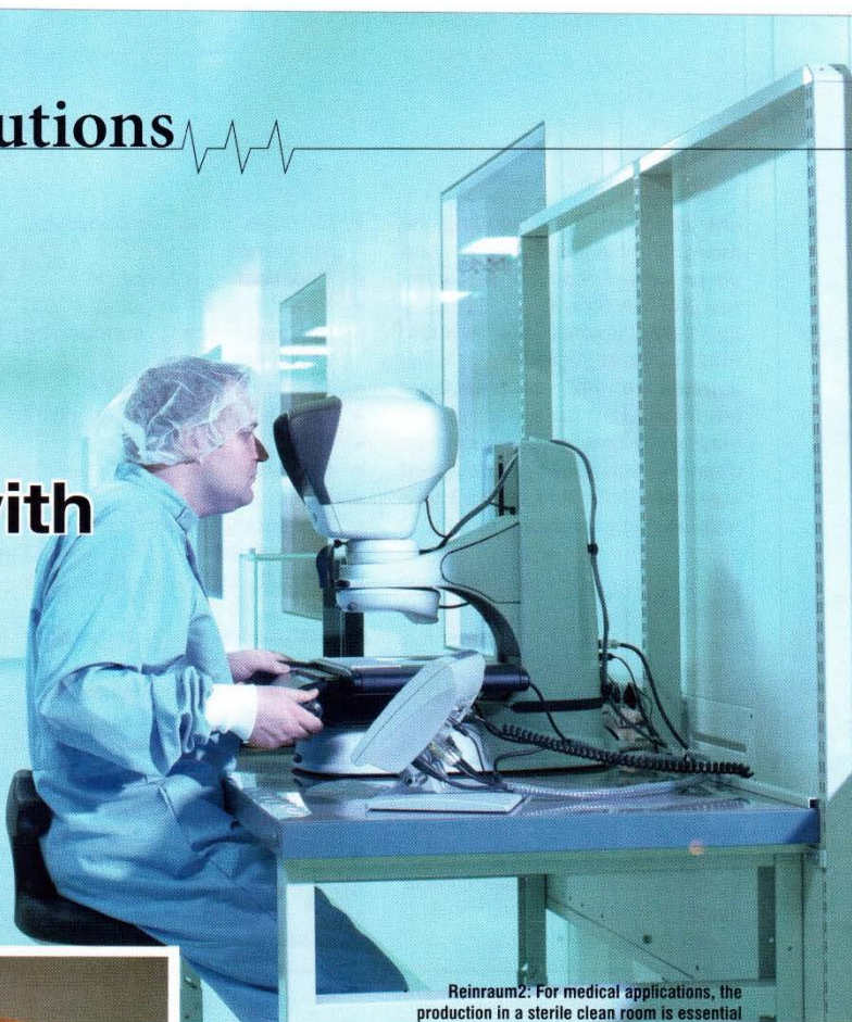
Reinraum2: For medical applications, the production in a sterile clean room is essential

Freudenberg offers innovative medical solutions